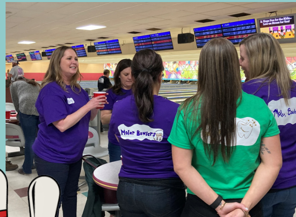
Team Coastal Cosmetic Dentistry